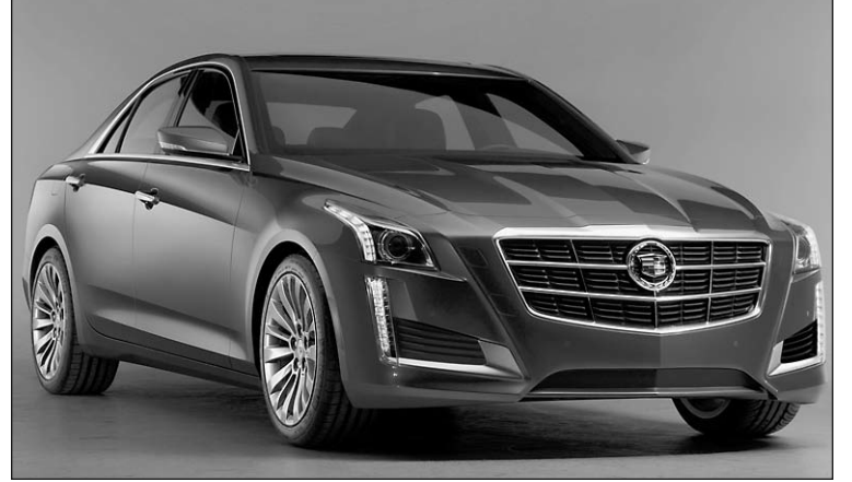
2014 Cadillac CTS