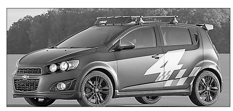
2013 SEMA Chevrolet All-Activity Sonic concept car

an "Urban Cool" Impala, a Malibu Piszar said. "We'll gauge the pub-LTZ and a Personalization Cruze Diesel concept car. All these vehicles were designed to show what can be done with Chevy's aftermarket kits and parts.