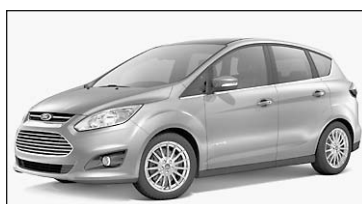
2013 Ford C-Max