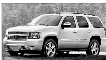
2013 Chevy Tahoe