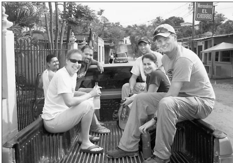
Detroit-area engineers in Nicaragua for Engineers Without Borders.