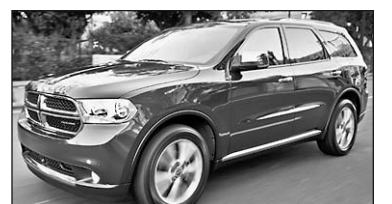
2013 Dodge Durango