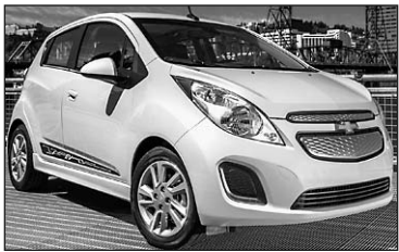
2014 Chevy Spark EV

It's priced under $19,995 with tax incentives and is now avail-