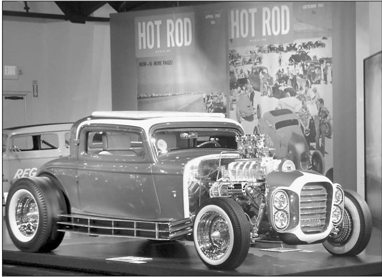
The Gilmore Car Museum shows off classic hot rods

The Gilmore Car Museum is located just 20 minutes northeast of Kalamazoo on M-43 and Hickory Road.