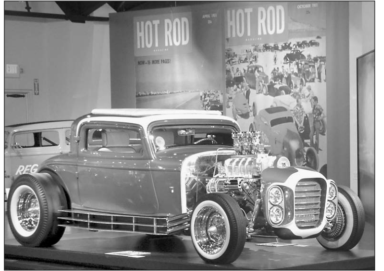
The Gilmore Car Museum shows off classic hot rods

The Gilmore Car Museum is located just 20 minutes northeast of Kalamazoo on M-43 and Hickory Road.