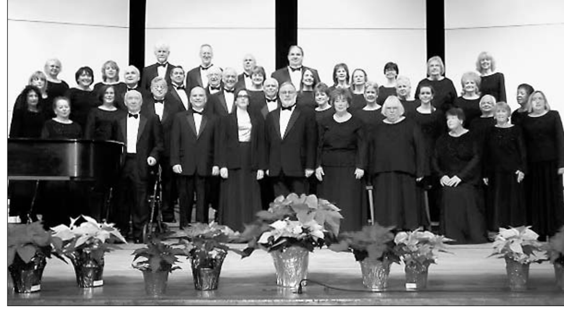
The GM Chorus gives about 25 concerts a year at local churches, senior centers, and veterans' hospitals.

To learn more about the deal, call the Warren Library administration at 586-574-456.