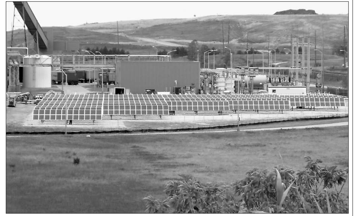
Solar Panels at Orion Assembly helped GM save on energy costs, meet EPA's ENERGY STAR Challenge.

Employees utilize a timeschedule-controlled energy management system to shut off both its global facilities by 28 percent