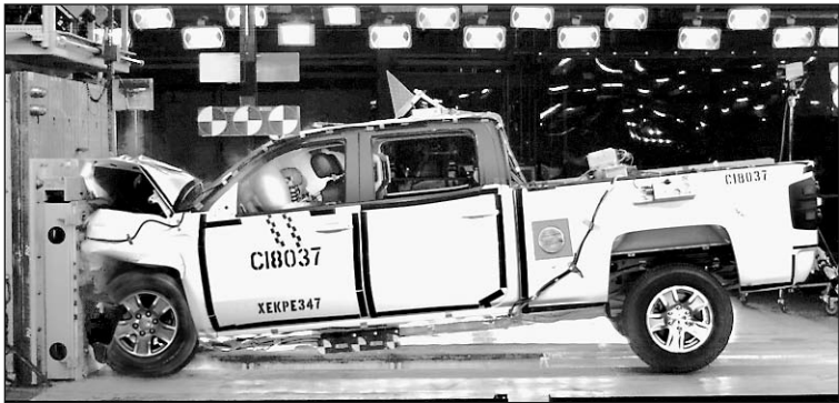
The 2014 Chevy Silverado 1500 and GMC Sierra and Sierra Denali 1500 are the first pickups to receive the NHTSA five-star Overall Vehicle Score.

Rear Vision Camera with Dynamic Guidelines allows the driver, when in reverse, to view objects directly behind the vehicle via the radio screen in the center stack, allowing for easier parking and backing maneuvers, Kent said. New for this year are standard lap belt pretensions in the front-seat outboard safety belts.