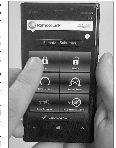
New GM Phone Apps

"RemoteLink is one of the most-used automotive manufac-