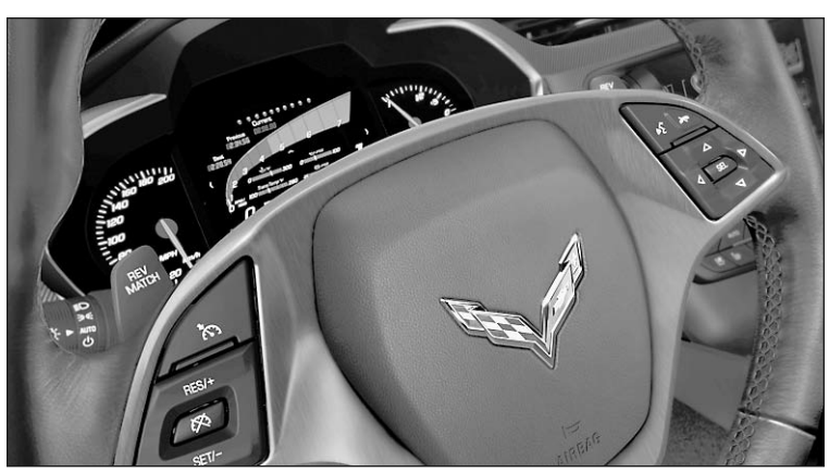
The 2014 Stingray display is designed to look sharp and be easy to use.

• Track theme – Inspired by the cluster of the Corvette Racing C6.R, this theme prioritizes the information vital for a successful track outing, said Doran, including a "hockey stick" style tachometer, large gear indicator and shift lights;