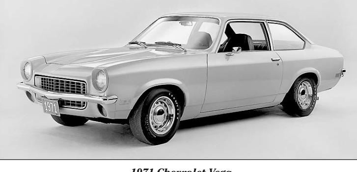
1971 Chevrolet Vega