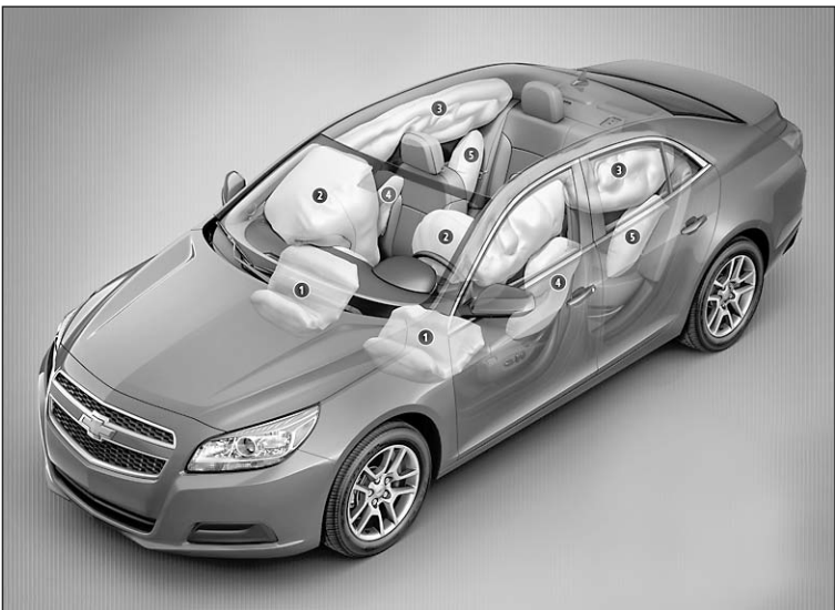
2013 Malibu pictured with 10 standard air bags

cylinder engine and an Ecotec 2.0L turbo that makes 259 horsepower and 260 lb.-ft. of torque, Lyons said.