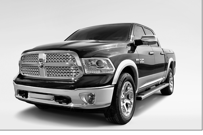
2013 Ram 1500

Hegbloom said Consumer Reports is a resource used mostly by younger, more educated and