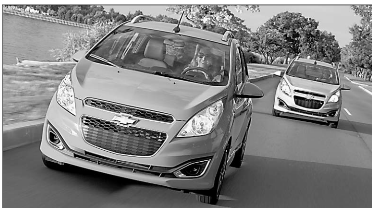
2013 Chevy Spark