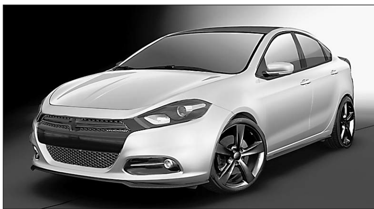
2013 Dodge Dart