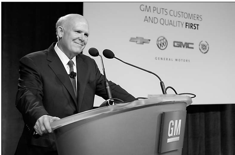
GM CEO Dan Akerson congratulates employees on their quality efforts.