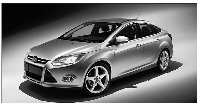
2013 Ford Focus