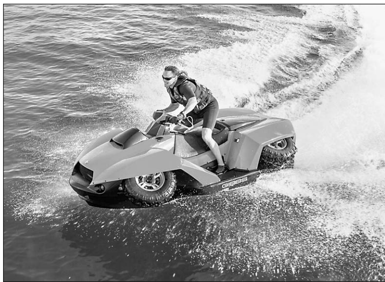
Demonstration of the Quadski by Gibbs Sports Amphibians Inc.

She said that, with its 361-cubic-inch V8 under the hood producing 330 horsepower, "It's fun. It's a great car to drive."