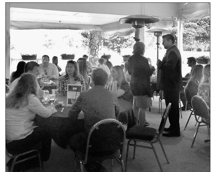
Young leaders from the Auburn Hills area enjoy social networking.

The June event was the third of five Young Professionals Mixers planned for the year. The next event takes place on Thursday, Aug. 22, at bd's Mongolian Grill in Auburn Hills.