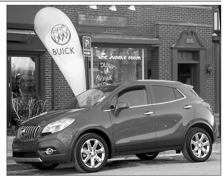
2013 Buick Encore

'Safety is a top priority in Buick's product renaissance, as evidenced by receiving these latest safety accolades for Encore,'