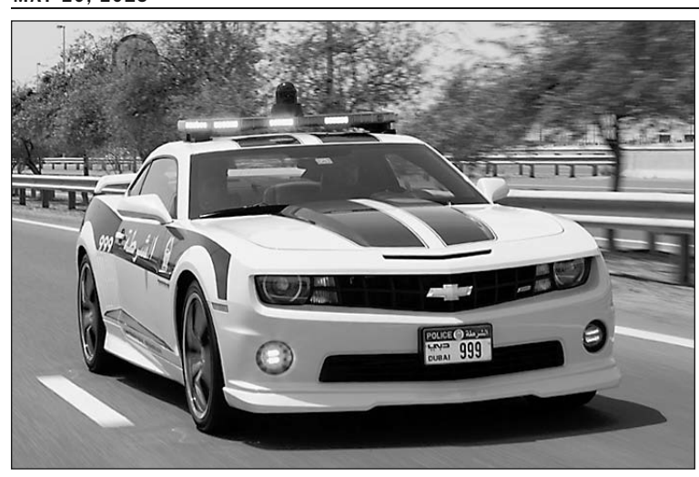
The Camaro SS police model in Dubai.