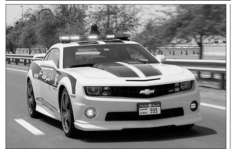
The Camaro SS police model in Dubai.