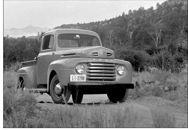
The 1948 Ford F-1 pickup truck