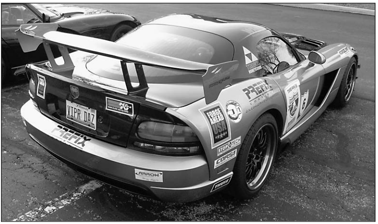
The Team Prefix 700 hp 8.4-liter V10 2008 SRT-10 Dodge Viper

With Auburn Hills-based Prefix as the main corporate sponsor, Team Prefix hopes to go all the