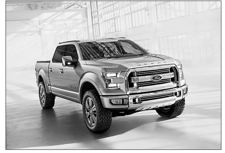
Sixty-five years later, the Ford Atlas concept