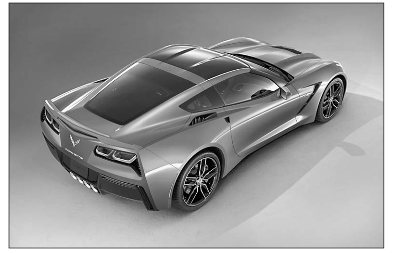
2014 Corvette Stingray

In the past, because of its engine power and performance, Corvettes often were compared