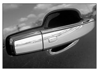
The new Malibu's 'Press Button.'

The 2013 Malibu is Chevrolet's cles, but scarce on cars in the first global midsize sedan and is sold in nearly 100 countries on six continents. It is the first 2013 midsize car to earn a 5-Star Overtem, the car verifies that the all Vehicle Score from NHTSA and a 2012 Top Safety Pick by the