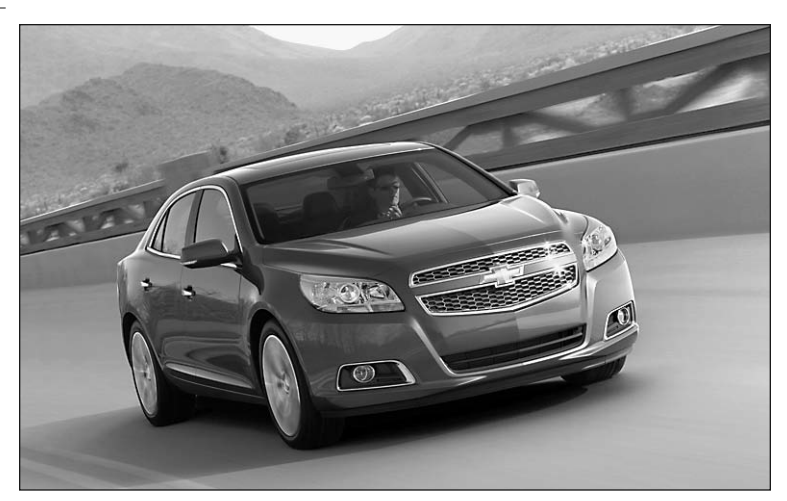
2013 Chevy Malibu