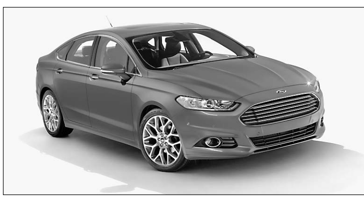
2013 Ford Fusion