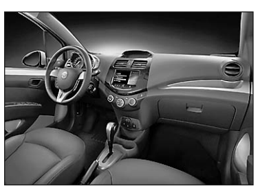
The Chevy Spark interior has swatches of lighter color matching the car's exterior on door panels and dashboard.

live video review inside each vehicle, highlighting the key features that earned each interior its honor.