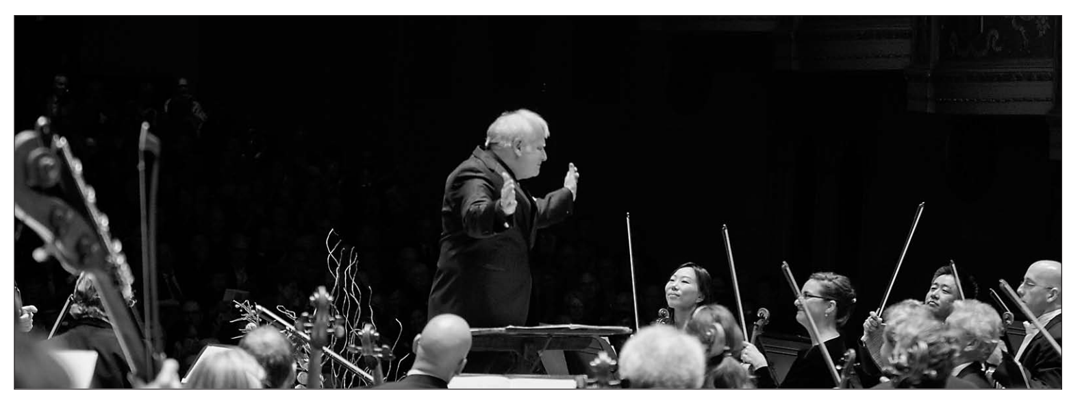
Thanks in large to a $350,000 GM Foundation grant, the Detroit Symphony Orchestra will be visiting world-famous Carnegie Hall in New York City.

If you have solid business news for this paper, please contact us at News@TechCenterNews.com.