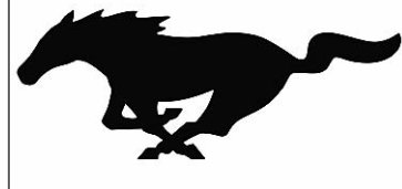
Mustang logo turns 50

Over the next half-century, the Schott Perfecto leather jacket fig-