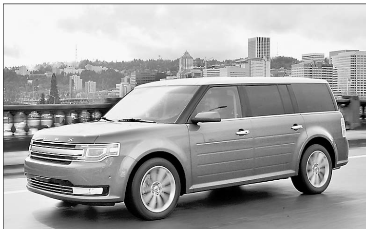
2013 Ford Flex

Commenting on the Flex, AAA auto buying experts cited the vehicle's roomy design, allowing ample space for passengers or packages. They described the ride as "quiet and well controlled" while giving a nod of approval to the EcoBoost version of available V6 powerplants.