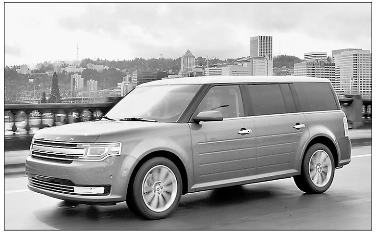
2013 Ford Flex

Commenting on the Flex, AAA auto buying experts cited the vehicle's roomy design, allowing ample space for passengers or packages. They described the ride as "quiet and well controlled" while giving a nod of approval to the EcoBoost version of available V6 powerplants.