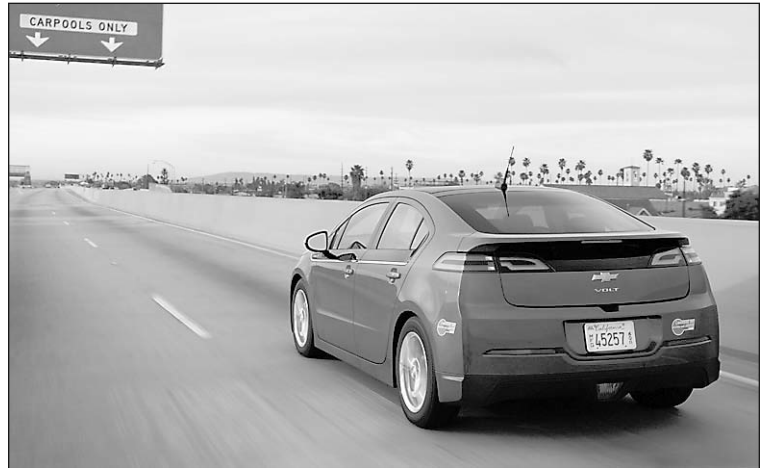
2013 Chevrolet Volt