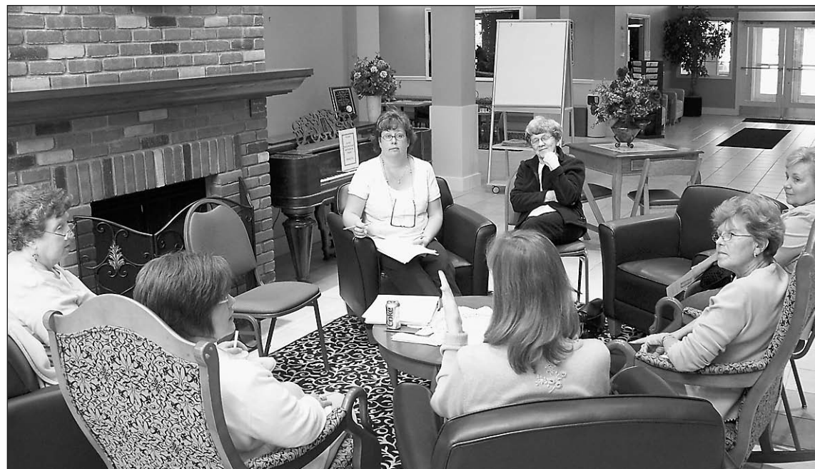
Women enjoy the comfortable surroundings at the Auburn Hills Community Center during a book discussion.

Yoga, Zumba and Tai Chi instructors are scheduled to be there to give demonstrations. Visitors will also be able to tour classrooms and the facility.