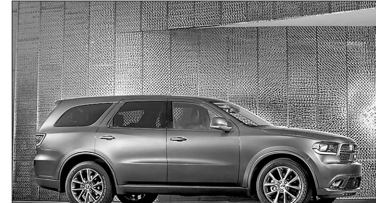
2014 Dodge Durango

Dodge officials said the Durango has a young demographic, one of the youngest demographics in the segment, and the latest Uconnect Access technology and