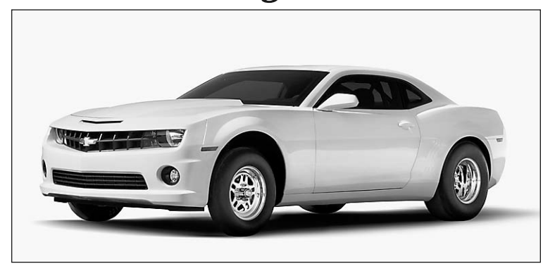
The latest Chevrolet COPO Camaro chassis is now on sale.

Supercharged crate engines based on the 2012 COPO Camaro program are also available, including a 327-cubic-inch engine with a 2.9L supercharger (part