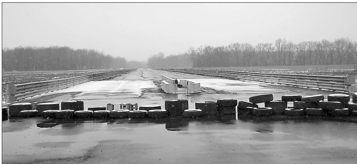
Onondaga Dragway, as it lies waiting for spring.

If you have solid business news for this paper, please contact us at News@DetroitAutoScene.com.