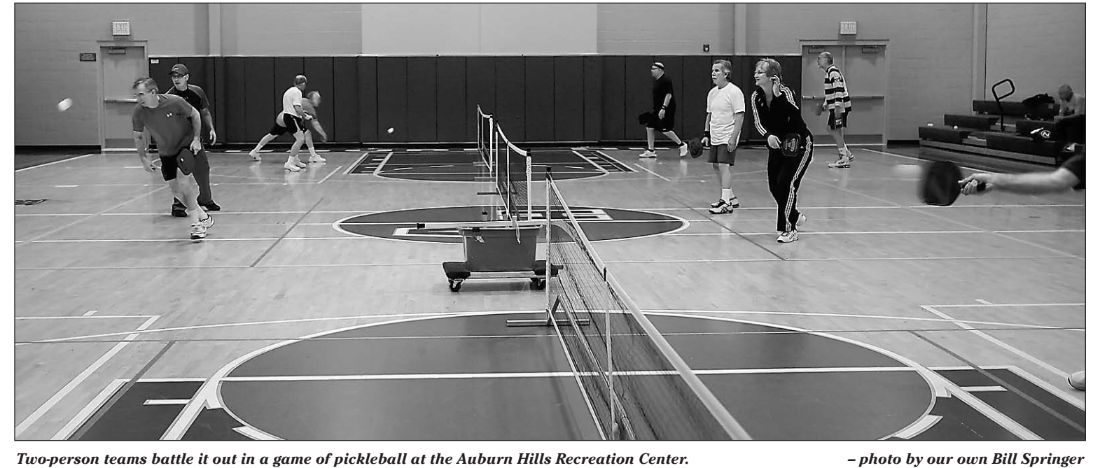
quet and uses a smaller version Two-person teams battle it out in a game of pickleball at the Auburn Hills Recreation Center.