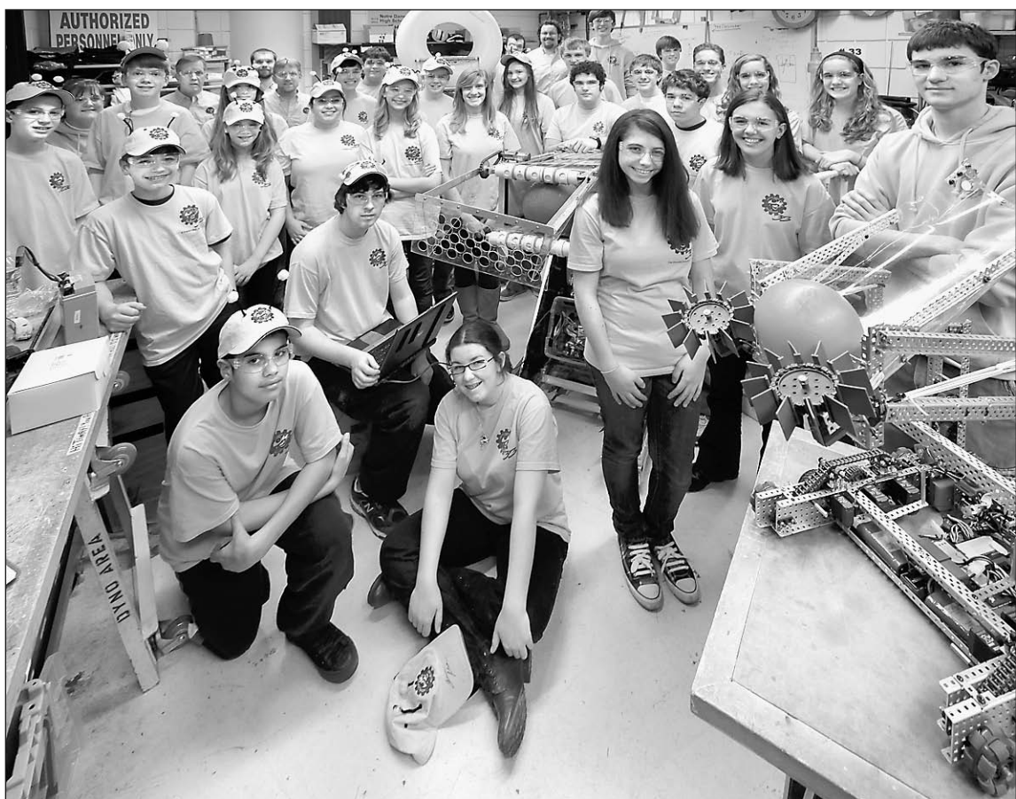
The Killer Bees of Notre Dame Preparatory take a short break from the hard work of readying their 'bot.'

become an engineer, and that she appreciates working on a FIRST Robotics team. "It provided the perspective and first-hand knowledge that pursuing your dreams is com-