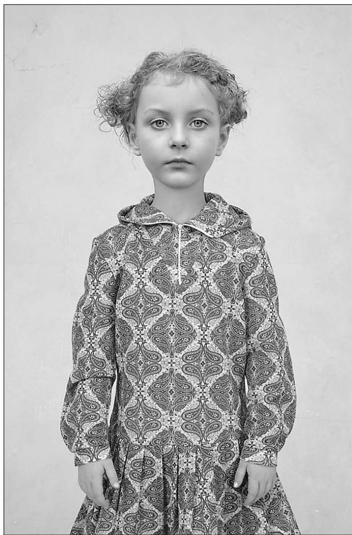
“Portrait of Antonia” taken in 2007 by Loretta Lux