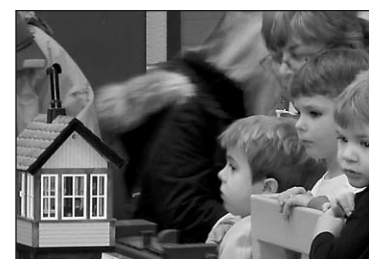
Kids are intrigued by all of the train exhibits, which demonstrate how railroads work. The 400 tables comprise 5 operating layouts.