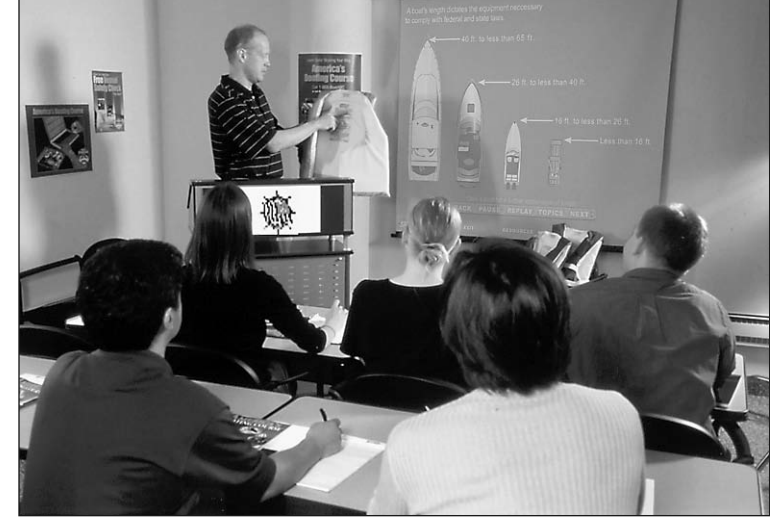
Power Squadron classes are now available for the spring.