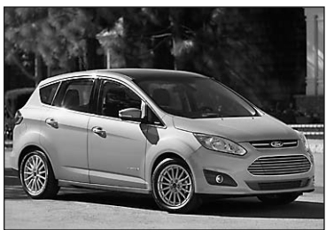
2013 Ford C-MAX