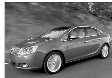
2013 Buick Verano

Cadillac passenger car sales increased 64 percent year-over-year as the all-new ATS and XTS continue to establish themselves in the luxury market.