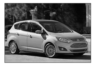
2013 Ford C-MAX

Ford Brand Stands Alone in '12 With 2 Million U.S. Sales Ford Motor Company's U.S. top 2 million in U.S. sales.