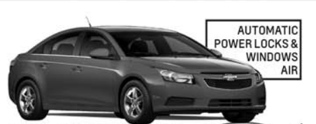
2013 CHEVY CRUZE LS • 42 MPG! WAS $19,020 • NOW $15,998!

COSTCO MEMBERS: GET A $500 COSTCO CARD WITH BUY or LEASE!