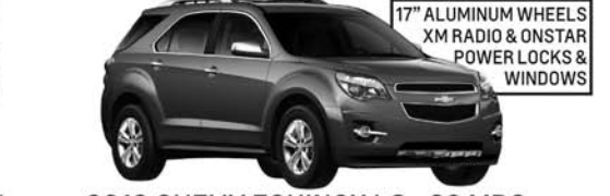
2013 CHEVY EQUINOX LS • 32 MPG WAS $24,580 • NOW $21,063!

24-mo lease • 10K miles/yr • No sec deposit! #DJ111264 NO GM DISCOUNT REQUIRED!