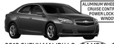
2013 CHEVY MALIBU LS • 34 MPG! WAS $23,150 • NOW $19,336!

24-mo lease • 10K miles/yr • No sec deposit! #D7159277 NO GM DISCOUNT REQUIRED!