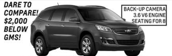
2013 CHEVY TRAVERSE LS • 24 MPG WAS $31,335 • NOW $25,126!

24-mo lease • 10K miles/yr • No sec deposit! #DF223805 NO GM DISCOUNT REQUIRED!