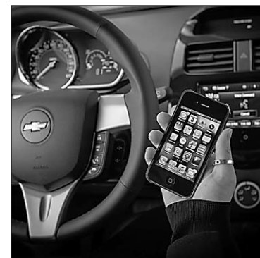
Siri, the Apple-developed intelligent assistant that helps car occupants get things done using voice requests.

"There's a little button on the steering wheel (that) allows you