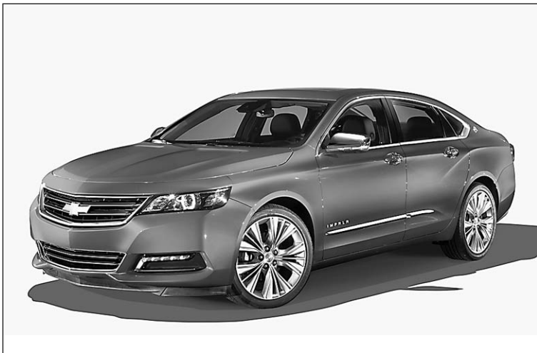
The redesigned 2014 Chevrolet Impala LTZ

"The vehicle will be showcased at customer and industry events throughout Asia, the U.S. and Europe, where it will be the centerpiece in Visteon's discussions with customers and partners about future technology trends and needs."