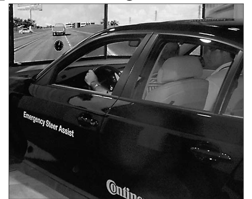
Continental Automotive demonstrates its Emergency Steering Assist technologies with an interactive driving simulator developed by Mechanical Simulation Corp.

Since the company was established in 1996, it has appeared on best-of lists across the globe for its car, truck, and motorcycle simulations.