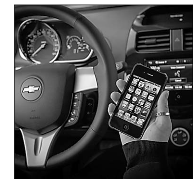
Siri, the Apple-developed intelligent assistant that helps car occupants get things done using voice requests.

"There's a little button on the steering wheel (that) allows you