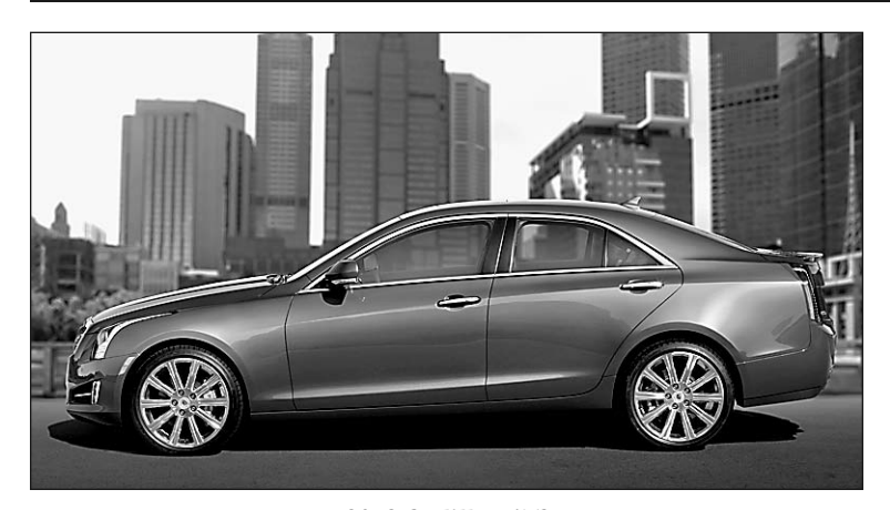
2013 Cadillac ATS