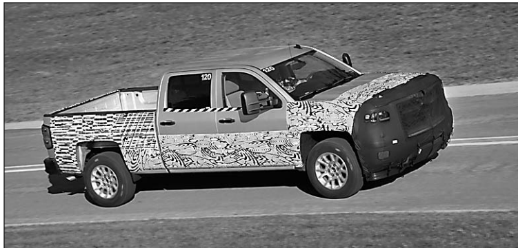
Another stop on the Silverado testing trail is this torture run at GM's Milford Proving Ground in early October.