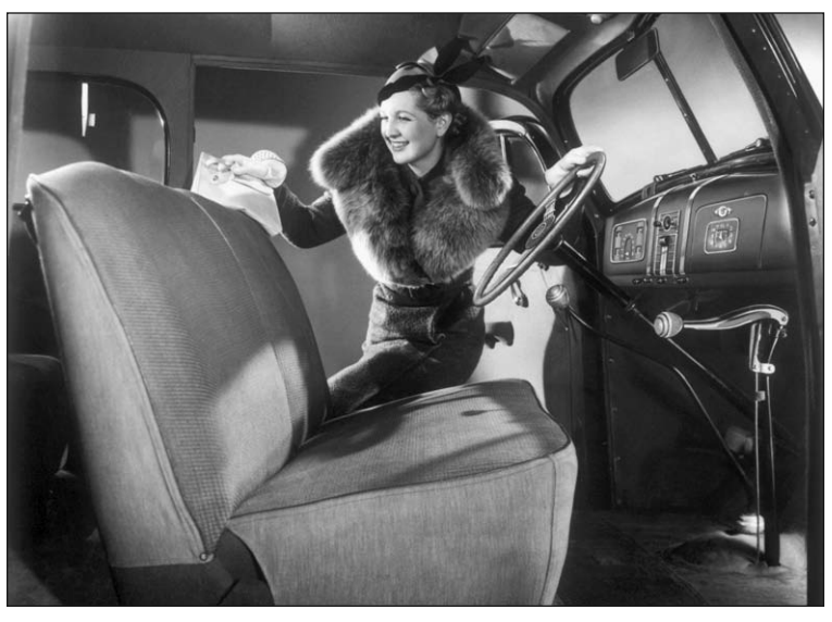
The 1937 Chevrolet Coach with a front bench seat.