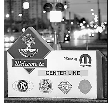
Signage at 10 Mile and Sherwood

formed a partnership with Magneti Marelli to extend Mopar's reach around the world. She also said that the Jeep brand is becoming a stronger global brand and can be serviced by Mopar parts and service centers.