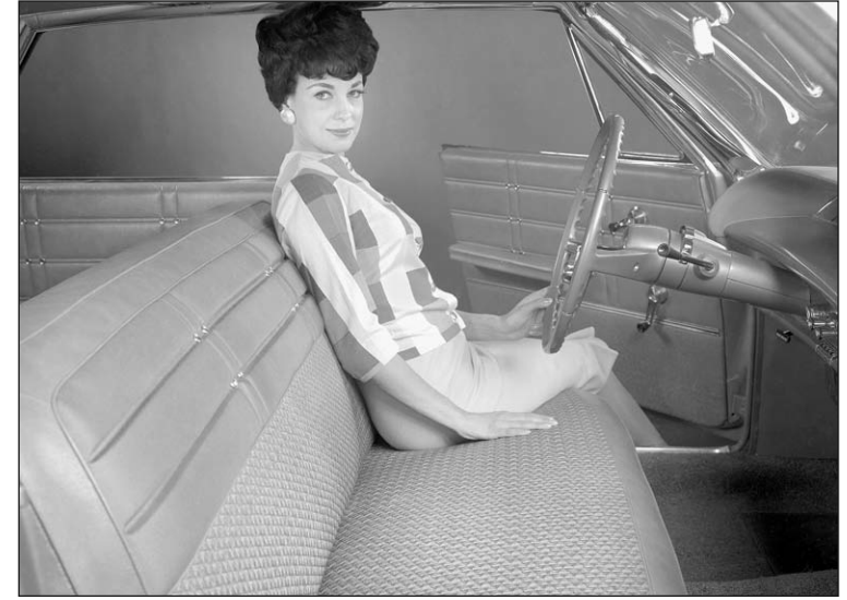
The 1963 Chevrolet Impala Sport Sedan with a front bench seat.