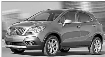
2013 Buick Encore

Fuel economy estimates for Encore models with all-wheel drive will be announced later.