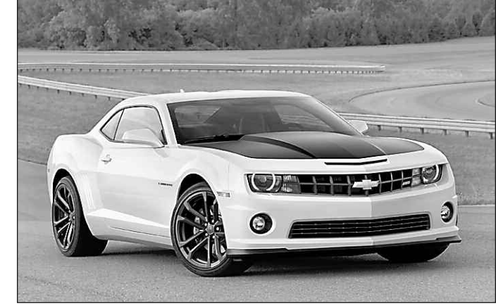
The Camaro 1LE.

'The 1LE offers such neutral balance, and tenacious grip, that I could charge into the Esses at nearly 125 mph and steer the car with the