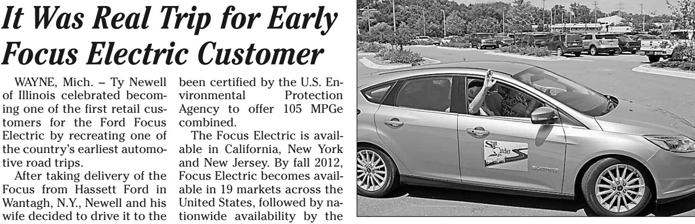
Ty Newell is recreating that pioneering trip in reverse.