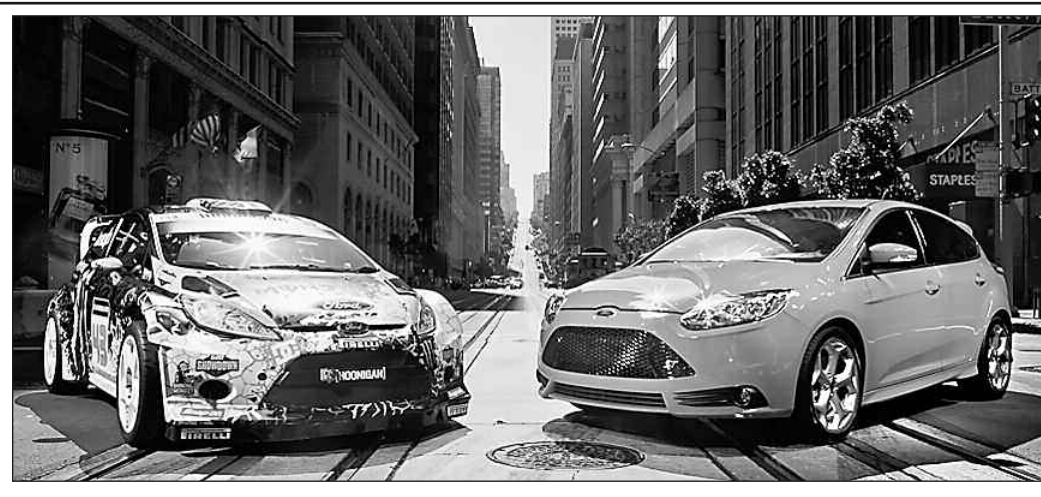
Ford used its tricked-out Fiesta driven by Ken Block to tape the hot auto video "Gymkhana FIVE."

Courses and workshops were selected, using the Office of Personnel Management Based on FEW's commit- Executive Core Qualifications (ECQ's) as the framework. ties, its training has been de- Many of the FEW participants signed to provide all federal, work at TACOM in Warren.