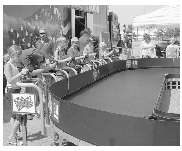
Children of GM Powertrain employees race small kart cars.

Chevrolet Gear & Axle plant in Lutz, who, of course, was at Hamtramck, which later be- Chrysler in the late 1980s came American Axle. She when the Viper debuted as a worked at the Vehicle Engineering Center in Warren at GM Tech Center for awhile before eventually returning to Pontiac.