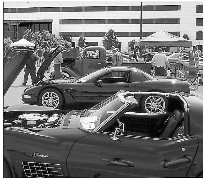
GM Powertrain employees enjoy the 11th annual show in Pontiac.

The employee car show gives employees just like Myers the opportunity to show off classic cruisers like hers.