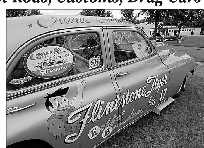
Dave Koffel's 1949 Packard Gasser called the "Flintstone Flyer" will be one of the marque vehicles at the Cars 'R Stars car show at the old Packard Proving Grounds in Shelby Twp. June 10.

"This show is for the drag fans, the people who want to see and hear these cars up