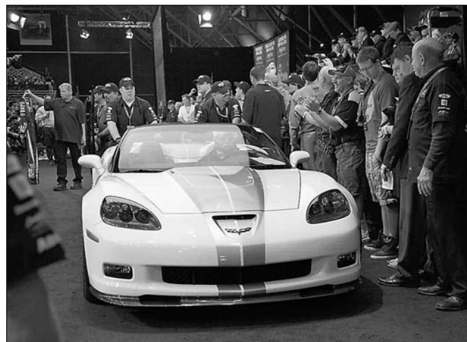
A 2013 Chevrolet Corvette 427 convertible served as pace car for the Chevrolet Indy Grand Prix racing June 1-3 on Belle Isle.

ance features include six-piston Brembo brakes and coolers for the rear differential, brakes and transmission.